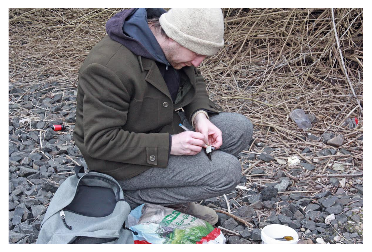
What is your most important artist tool? Is there something you can't live without in your studio?

SA is not inventive, it's just a repetition of all the things artists do: performances, sculptures, short films, drawings, photographs, video installations and site-specific projects. I work with polarities such as "public display" versus "personal views", "public tool" versus "personal use" and "public fascination" versus "personal disappointment".