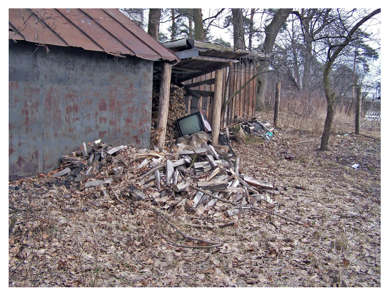
Global Village / 2007 / Luga, Russia

The project is called "Open Power". That's a play on words: power as energy, and power as authority. I'm an anarchist. This project is a metaphor for a common good economy.